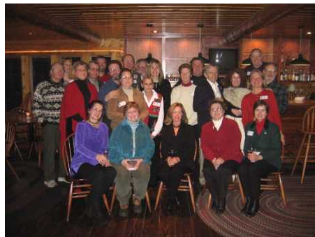
Left: The DRLPS Team at Bayside Dining during the annual Christmas celebration . . .