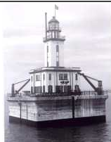
PO Box 307