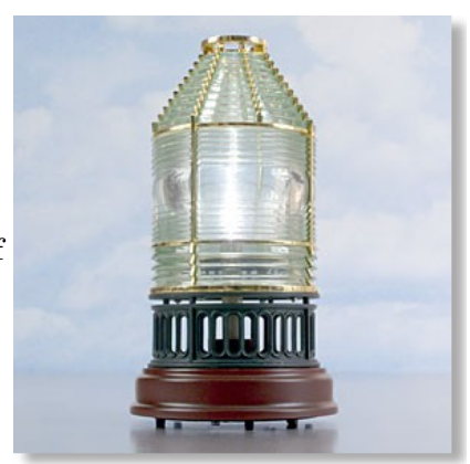
A picture of the Harbour Lights Third Order Beehive Fresnel Lens that will be auctioned at Stars.

Also presented for your consideration will be the following: a framed panel of Great Lakes Lighthouse stamps, a framed panel of Pacific Lighthouse stamps, hand embroidered items from our own Dotty Witten, a Lighthouse theme hand-hooked wool rug, a quilt pattern of the DeTour Reef Light produced by Carol Melvin, individually personalized golf shirts designed for you by Ann Method Green and several other items.