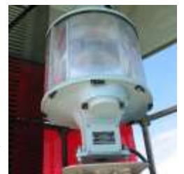
Six sided VRB-25 prior to removal from the DeTour Reef Light

On May 15, the U.S. Coast Guard installed an eight tier Vega VLB-44 LED Marine Beacon in the lantern of DeTour Reef Light, replacing the Vega rotating beacon (VRB-25) that has been in DeTour Reef Light for about 15 years. Vega Industries is a New Zealand company. The DeTour Reef beacon is programmed to flash white every 10 seconds (with a red sector to the North West). As such, it does not rotate. The vertical divergence is 2.5 degrees – making the beacon only visible at water level and not visible to aircraft at flying altitudes. The total power consumption is a maximum of 80 watts per each flash resulting in average power consumption per day of 96-watt hours. Seventy-four feet above the water, the beacon has a range of 16 miles.