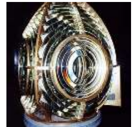
3 ½ order Fresnel Lens from DeTour Reef Light now on display in DeTour Passage Historical Museum

When DeTour Reef Light Station was constructed in 1930-31, the 1861 lighthouse tower from DeTour Point with its 1908 3½-order Fresnel lens was relocated to the reef light station. This lens was configured as a flashing white light with a characteristic of a one-second flash and a nine-second eclipse. The lens was manufactured by Barbier, Benard & Turenne Co. of Paris, France at a cost of $2,940.50 ($73,512 in 2012 dollars). The original shipping weight of the lens and components was 4,480 lbs. In 1936, the color changed from straight white to white with a red sector to the North West to warn of the dangerous reef. This was accomplished using a color plastic inside the lantern (the glass-enclosed room containing the beacon) which is unchanged to this date. In 1978, the Fresnel lens was removed and replaced by a modern beacon. The 1908 lens and its timing mechanism are now on display at the DeTour Passage Historical Museum. From 1996 until May 15, 2012, a Vega VRB-25 served as the beacon for DeTour Reef Light.