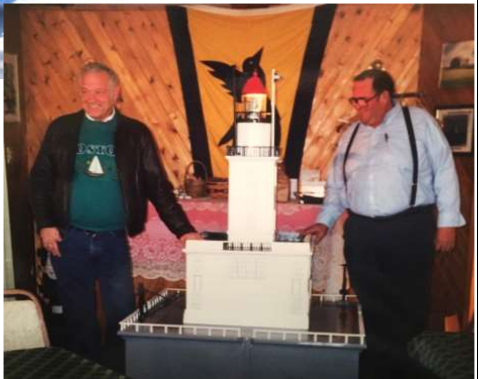
The model was first used at the DeTour Village 4th of July Parade in 1999