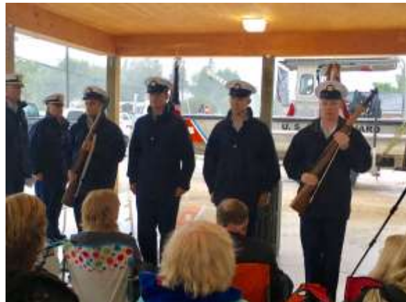
USCG Sector Sault Sainte Marie opening the

In the morning the CGC Buckthorn provided tours of the Cutter at the DeTour Village Ferry Dock before the memorial. A helicopter fly over by the airmen of the Sector Sault Sainte Marie Air Station was planned, but the weather did not cooperate.