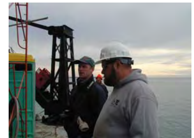
October 2003