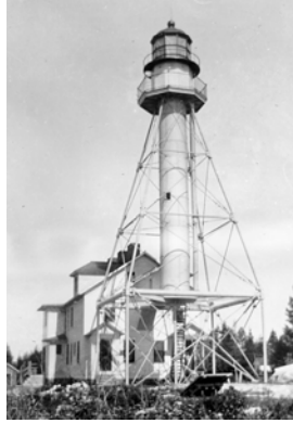
DeTour Point Light c. 1861 Established 1847