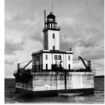
DeTour Reef Light 1931