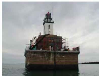
Exterior restoration completed on the upper part of the lighthouse shown in this photo by Dave Bardsley October 2003.

NONPROFIT ORGANIZATION U.S. POSTAGE PAID DRUMMOND ISLAND MI 49726 PERMIT No. 11