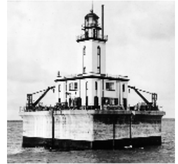
DeTour Reef Light 1931