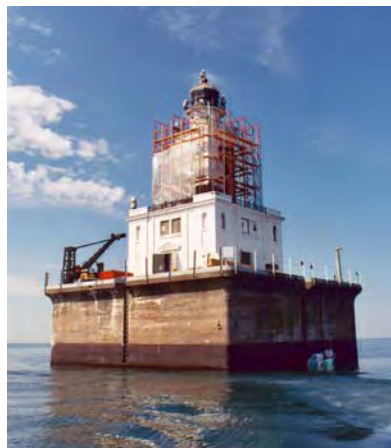
The DeTour Reef Light major exterior and interior restoration project is nearly complete.

NONPROFIT ORGANIZATION U.S. POSTAGE PAID DRUMMOND ISLAND MI 49726 PERMIT NO. 11