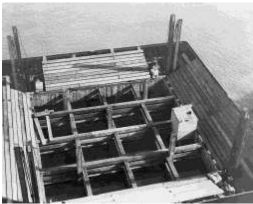
The finished crib at Watson's Coal Dock

Sometime during the late 1920s, the Lighthouse Service determined that the lighthouse at DeTour Point would need to be replaced with an off-shore facility. The St. Mary's River is the only shipping link between northern Lake Huron and Lake Superior, and the DeTour Reef lurks only 21 feet below the surface, a hazard for all St. Mary's traffic. At the time, accurate navigation around the reef was not possible, and so the new lighthouse would be located on the reef itself, almost a mile from the nearest land. Here it would serve to guide ships in upper Lake Huron to the mouth of the St. Mary's and the DeTour Passage. General foreman for the project was to be John Sellman. Sellman had been working for the Lighthouse Service since 1909, and had been in charge of the Stannard Rock and Martin Reef projects, and he had an experienced crew available. The new light on DeTour Reef was to be anchored on the reef itself, using an underwater structure called a crib.