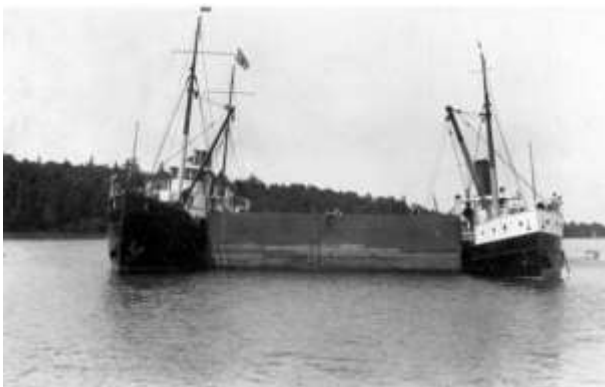
Floating the crib out to DeTour Reef

Before we describe what the crib was to be, we need to note what it wasn't. There are several misnomers in current usage today. An example might be the practice of confusing the word "cement" with the word "concrete". "Concrete" is a word that describes a mixture of sand, gravel and water, bonded together by "cement", a heavy grey-colored powder. When the cement takes up the water in the mixture, it once again becomes hard, like the rock from which it was made. Another point of confusion is the practice of using