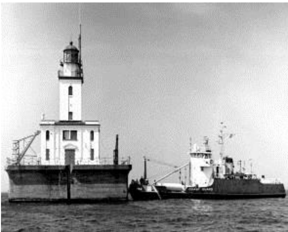
2014 DRLPS Collector's Postcard