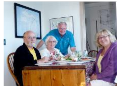
Wow! What a meal!

This year DeTour Reef Light will undergo significant repairs to eliminate the damage caused by leaks and condensation. The roof will be completely covered with a heavy-duty roofing membrane to eliminate water intrusion. Additionally, the south opening window in the tower room will be made watertight and the deck at the watch room level will be sealed at the joints of the castings. Finally, the ceiling in the dining room, which suffered major damage from the leaks in the watch room window, will be replaced/re-plastered. All other damaged plaster will be repaired and re-painted. Because of the extent of these repairs, the lighthouse will not be available for tours and keepers from Sunday night until noon on Friday. Contractors will be required to clean up all construction debris, tools and material and store them in the basement of the light. Accordingly, until the construction work is completed (completion is scheduled by August 1 st ) keepers will not be able to reserve the lighthouse for extended stays or mid-week programs.