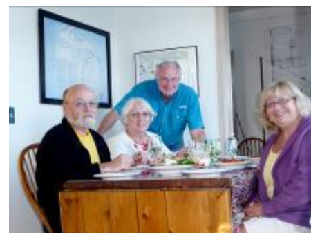
Wow! What a meal!

This year DeTour Reef Light will undergo significant repairs to eliminate the damage caused by leaks and condensation. The roof will be completely covered with a heavy-duty roofing membrane to eliminate water intrusion. Additionally, the south opening window in the tower room will be made watertight and the deck at the watch room level will be sealed at the joints of the castings. Finally, the ceiling in the dining room, which suffered major damage from the leaks in the watch room window, will be replaced/re-plastered. All other damaged plaster will be repaired and re-painted. Because of the extent of these repairs, the lighthouse will not be available for tours and keepers from Sunday night until noon on Friday. Contractors will be required to clean up all construction debris, tools and material and store them in the basement of the light. Accordingly, until the construction work is completed (completion is scheduled by August 1 st ) keepers will not be able to reserve the lighthouse for extended stays or mid-week programs.