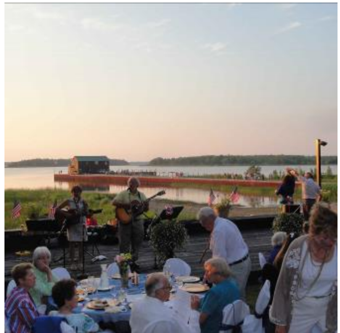
On the shore.....