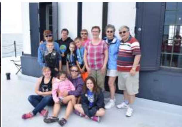
The Method Clan gathered between tours for a photo. Family came from far and wide—Alaska, Brazil and throughout the Midwest.

Over Labor Day weekend, 32 of some of the closest members of my huge extended family gathered on Drummond Island. Thirteen of us were able to tour the DeTour Reef Light.