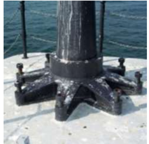
Before the lighthouse Keepers found a solution, cleaning bird droppings was a regular and time-consuming chore.