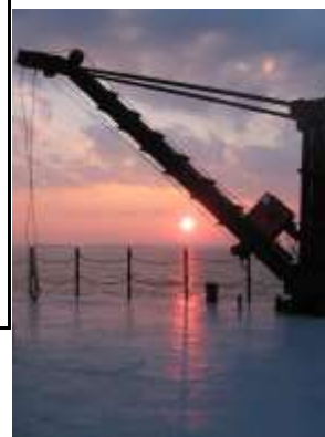
Beautiful sunsets, as well as sunrises, to be seen from the deck of the light.