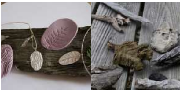
Materials to bring and some wonderful examples of what the finished pieces of jewelry could look like!

As we will not be able to go out collecting natural materials on the Light, participants should be on the lookout for interesting pieces of wood, driftwood, unusual buttons, small pine cones, leaves, any rocks that have an interesting surface, and items that have a unique surface that would make a mold design. You would bring these items with you to use and share with the other participants.