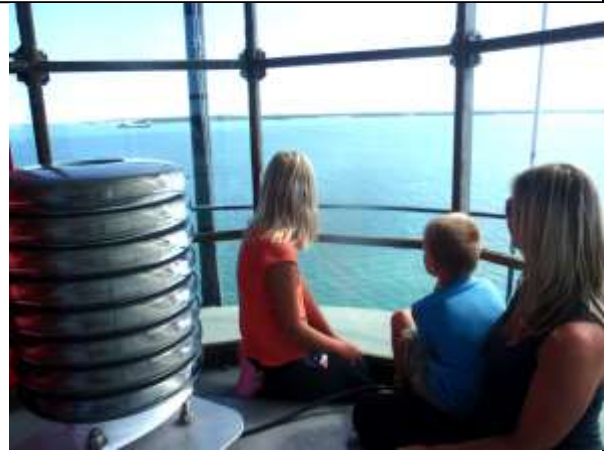
Fantastic view from the lantern

An application and keeper handbook can be downloaded from www.DRLPS.com . Cost is $220 per person ($200 per person for members of DRLPS) – children are half price. Membership cost is $30 and includes all in your household. Keepers may extend their stay on the light (either before or after their weekend) at half the nightly rate. For more information go to www.DRLPS.com , email keepers@DRLPS.com or call 906-493-6609.