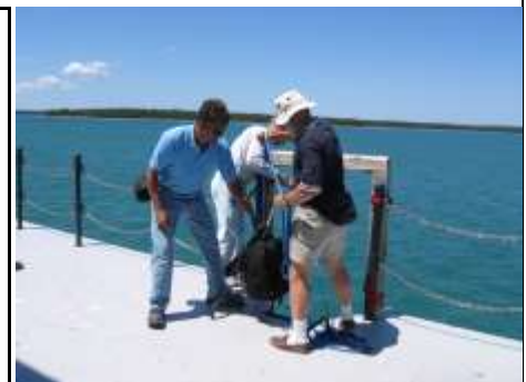
One of the duties of the keepers, helping people and supplies to the top of the light.