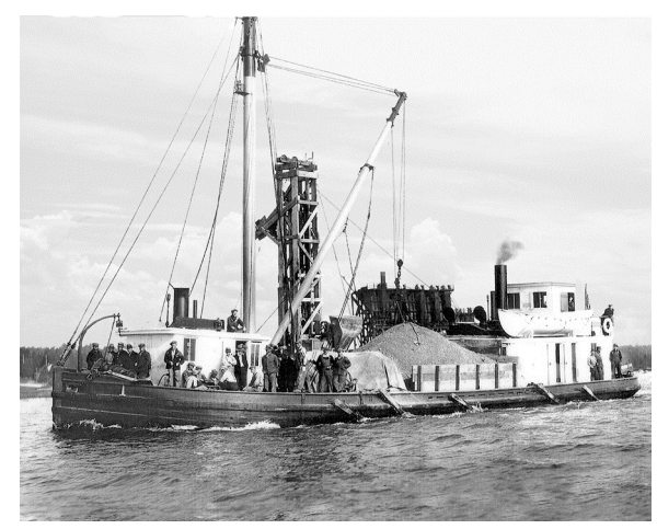
Barge ELM on a mission

The barge that hauled the cement to the site was about 125 feet long and 50 feet wide. It would be loaded at night and head out to the