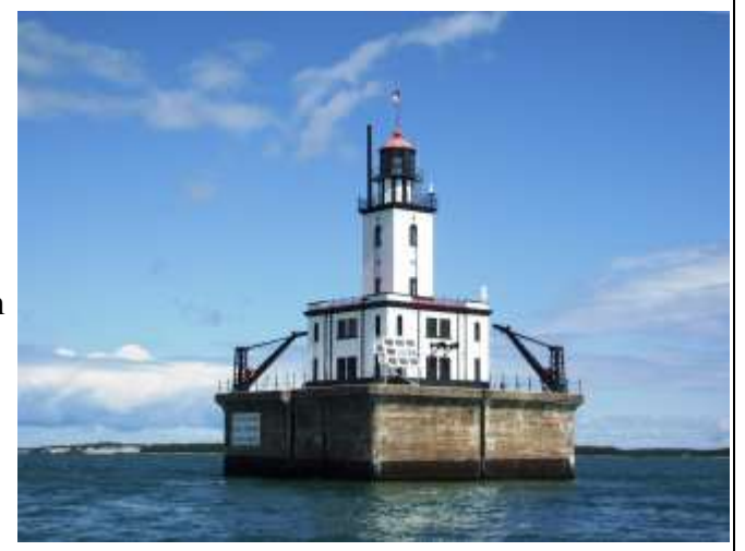
The deck of the DeTour Reef Light will be upgraded this summer with the help of a grant from the Michigan Lighthouse Assistance Program, which is funded by sale of lighthouse license plates. The lighthouse is owned and maintained by the DeTour Reef Light Preservation Society (Photograph courtesy of DeTour Reef Light Preservation Society).

In addition to the project at the DeTour Reef Light, MSHDA also awarded grants to two other lighthouse projects in Michigan. The Keweenaw Waterway Lighthouse