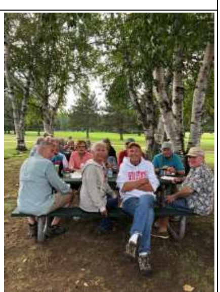
The awards ceremony was enjoyed by all the players even though they were smelling the brats and ready to eat.

City). Anyway the Esprit 'd Corp was great, refreshments enjoyable, the brats