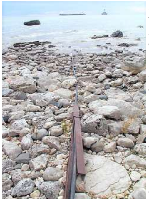
Power cable before 2003 repair to steel protection

ment can be used to send an electrical signal down the cable to get an approximate location of the failure. To do this, the exact configuration of the cable must be known, which can only be determined by disconnecting the cable at one end, requiring the coordination of the power company and an electrical contractor. If the failure is on shore or close to shore correction may be an affordable solution. If the failure is on shore or close to shore correction may be an affordable solution.