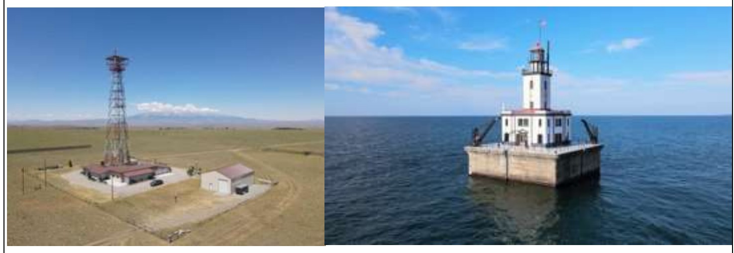
Our "lighthouse" in Big Timber, Montana, former AT&T microwave relay site in front of the Crazy Mountains.