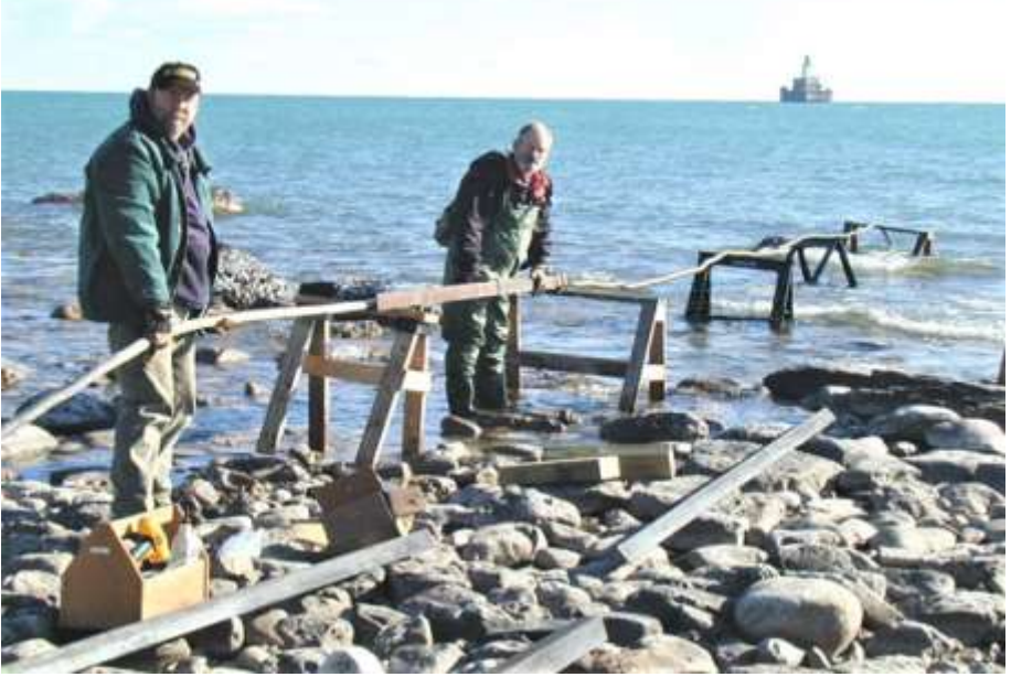
Placing new steel protection on power cable to DeTour Reef Light

DRLPS has consulted with several companies referred by Cloverland Electric on possible ways to determine how to address the ground fault. Only two methods were suggested: 1) replace the entire 4,000 feet of cable or 2) locate where the fault occurs on the cable and splice in a fix. Specialized equip-