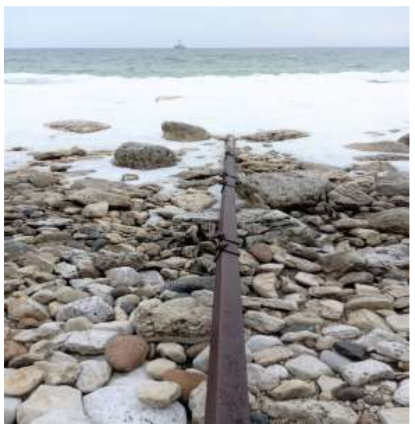
DeTour Reef Light power cable with steel protection looking West