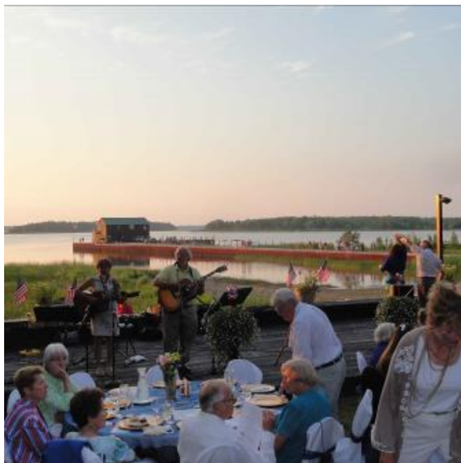
On the shore.....