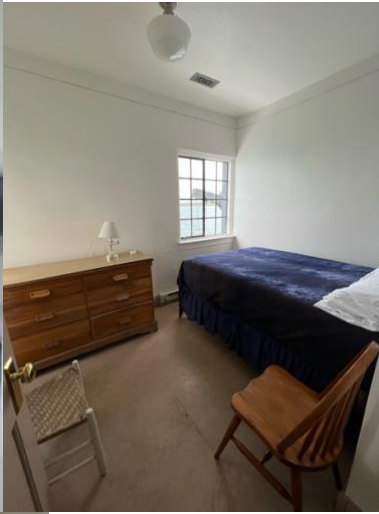
Top Left: Assistant Keeper's Room