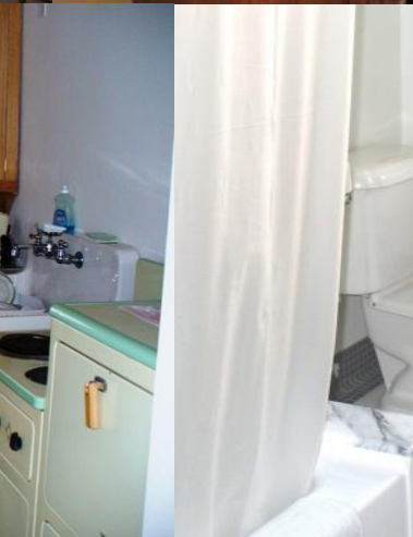
Bottom Left: Kitchen